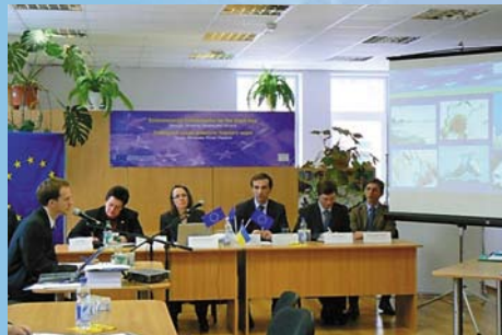
Project Public Outreach Conference December 2007, Kyiv, Ukraine

The Project team pursues a policy of openness and transparency by widely disseminating information on the Black Sea environment and Project activities amongst stakeholders.