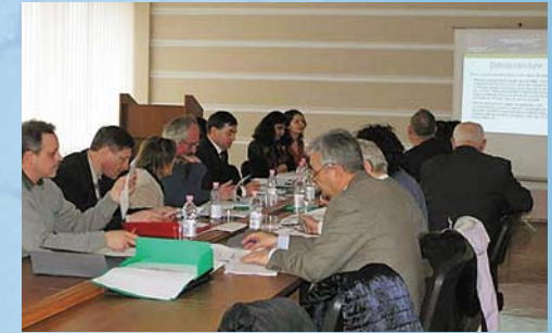
Meeting of the legal and institutional working group March 2008, Chisinau, Moldova

the Project experts are helping to improve national water legislation, particularly the Draft Water Law and relevant secondary legislation, bringing it in line with the EU Water Framework Directive and preparing a relevant regulatory assessment, implementation plan and cost analysis.